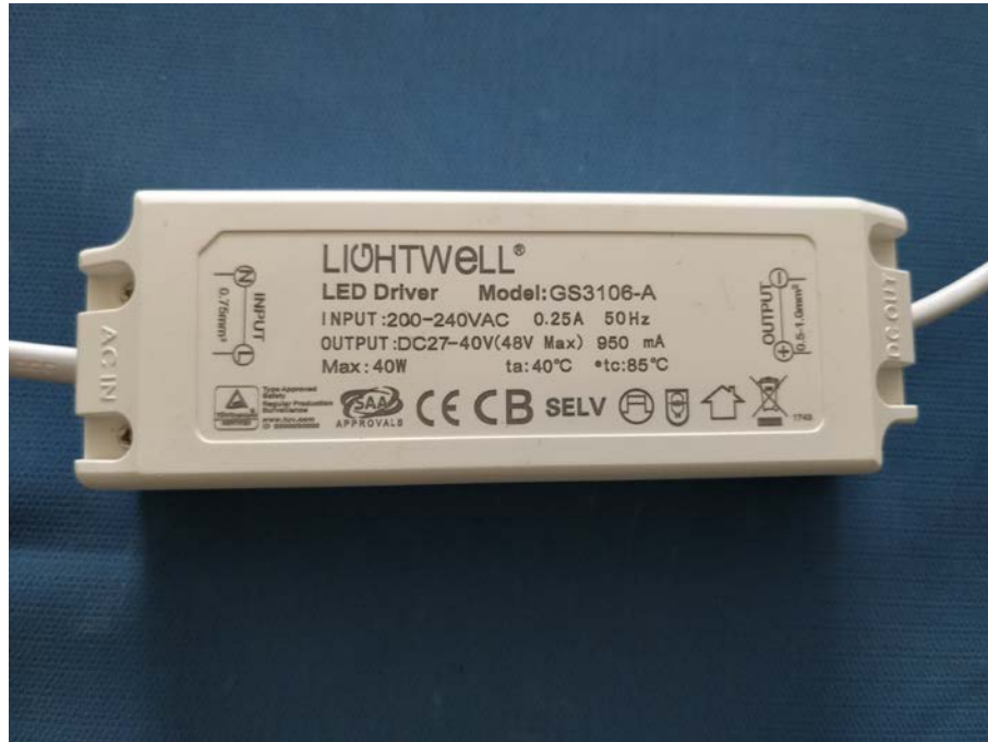
Photo 3 General Appearance of the EUT