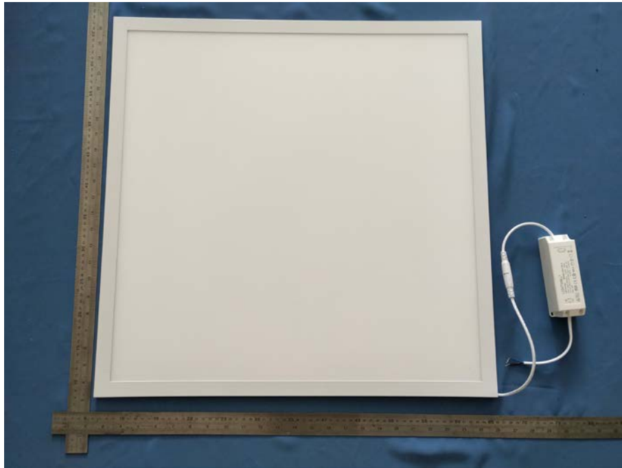
Photo 1 General Appearance of the EUT